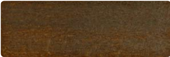
Golden Copper - CGC