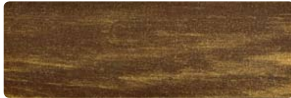
Burnt Gold - CBG