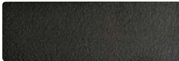
Dark Walnut - CDW