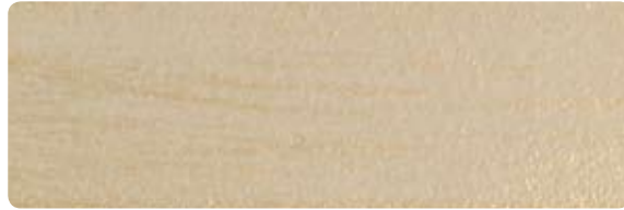
French Gold - CFG