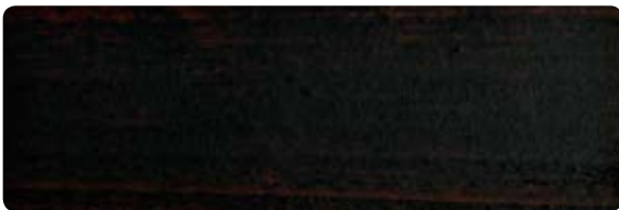
Mahogany - CMA